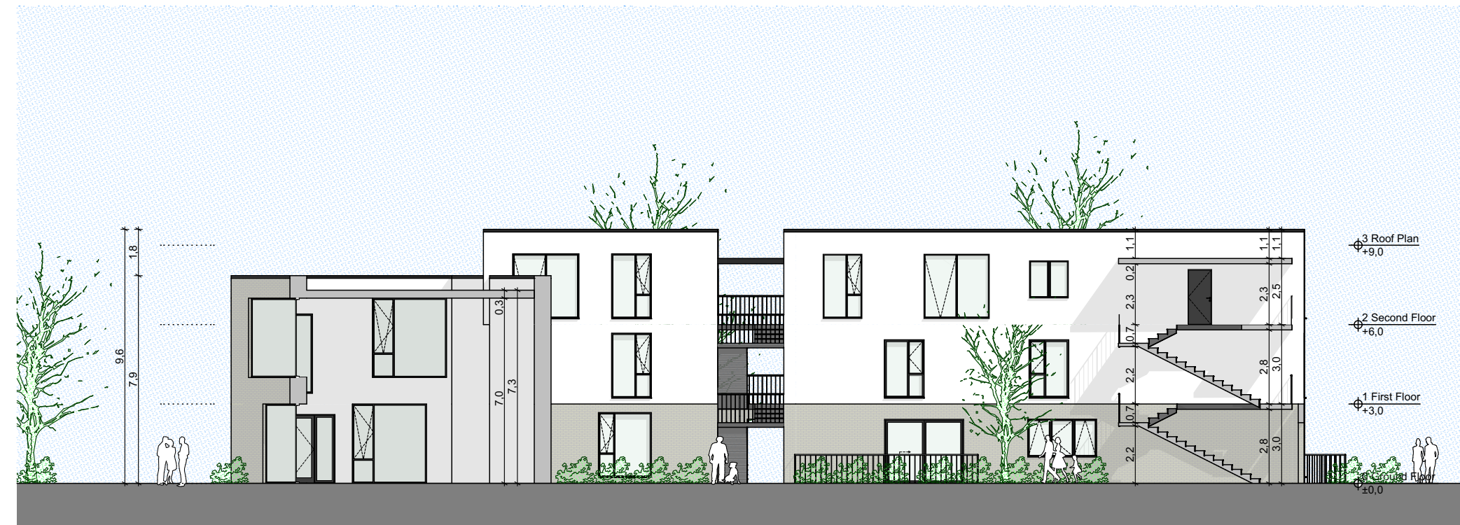
2 Courtyard SouthEast Elevation 1:200