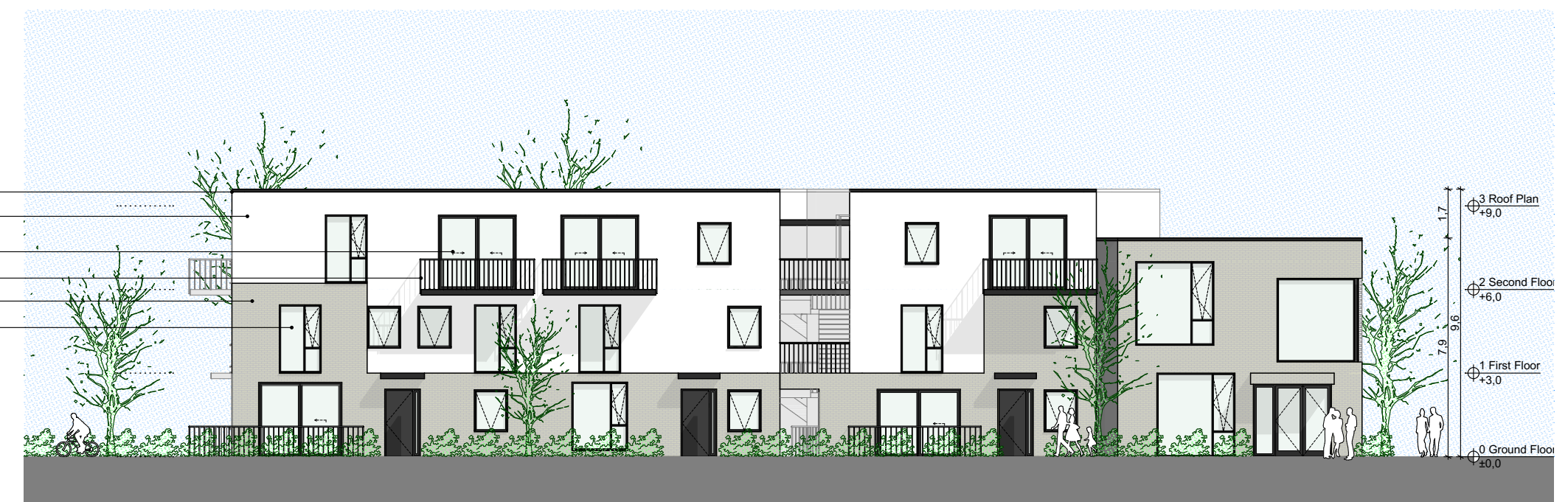
NORTH WEST ELEVATION 1:200