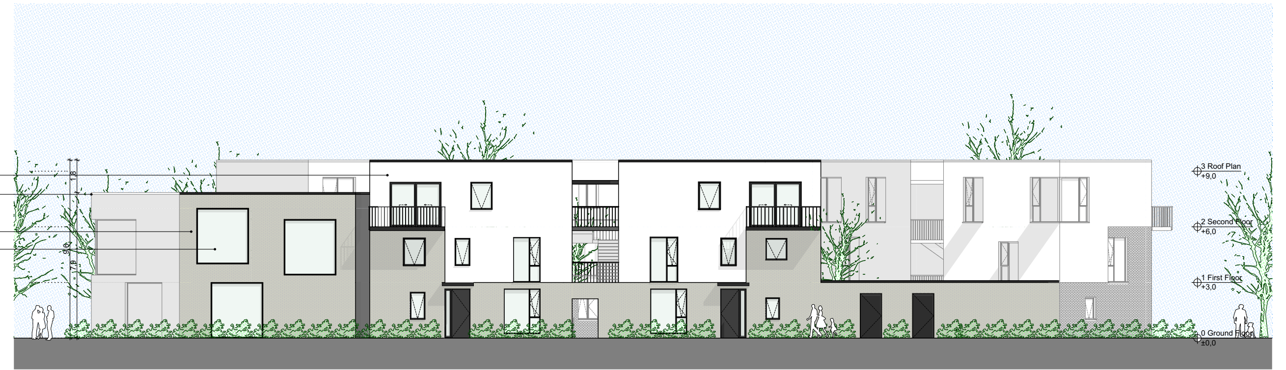
SOUTH ELEVATION 1:200