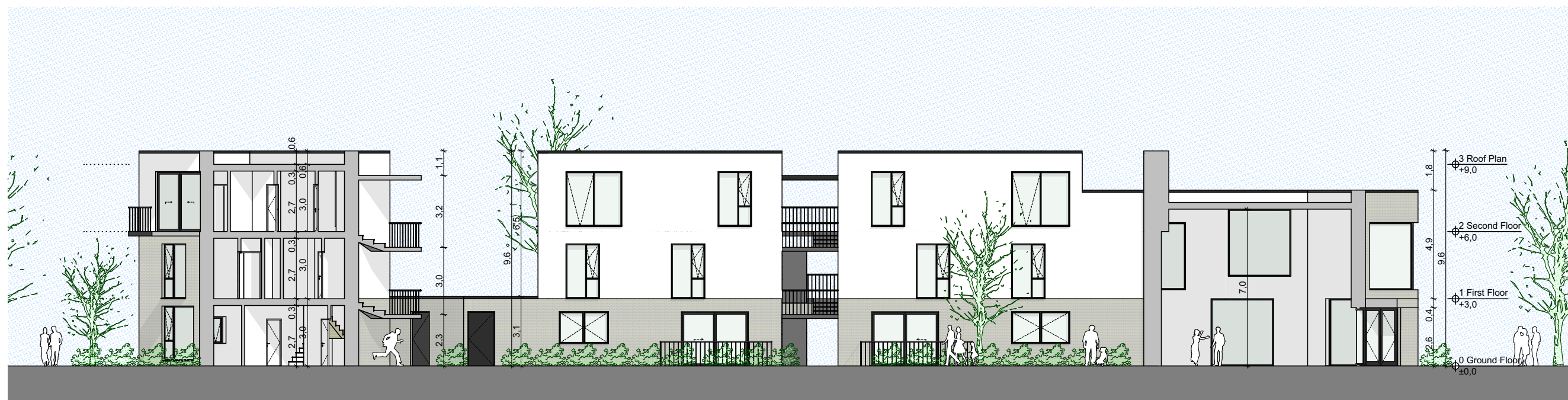
4 Courtyard North Elevation 1:200