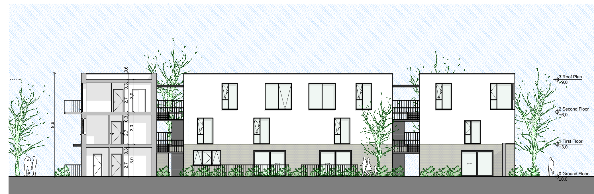
3 Courtyard SouthWest Elevation 1:200