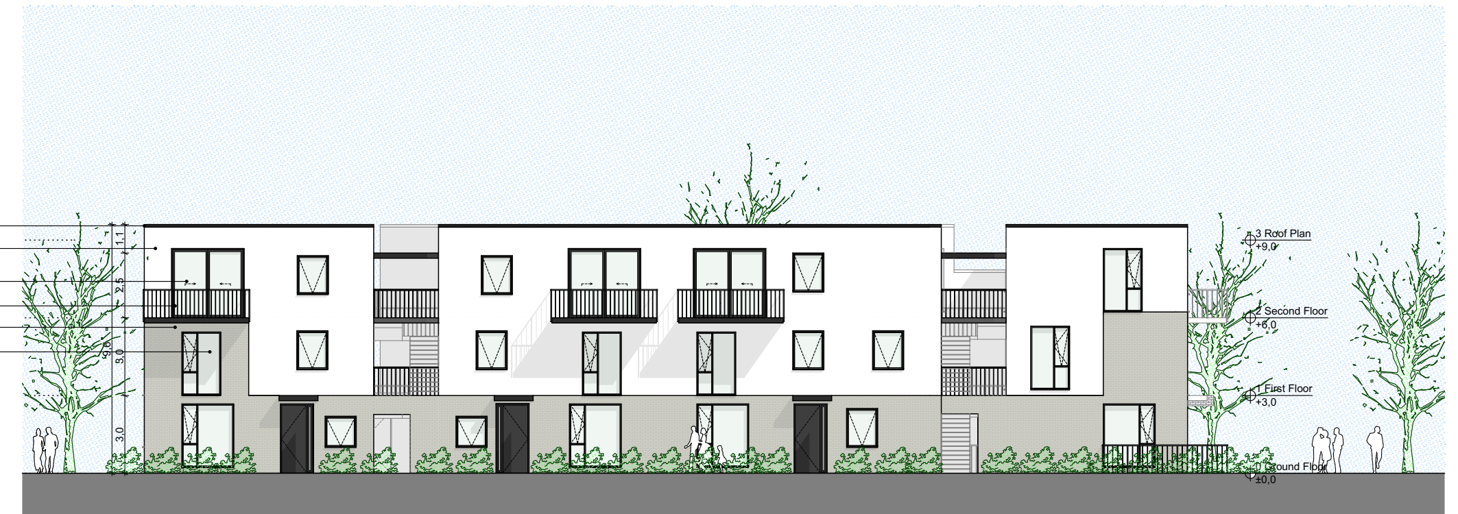
NORTH EAST ELEVATION 1:200